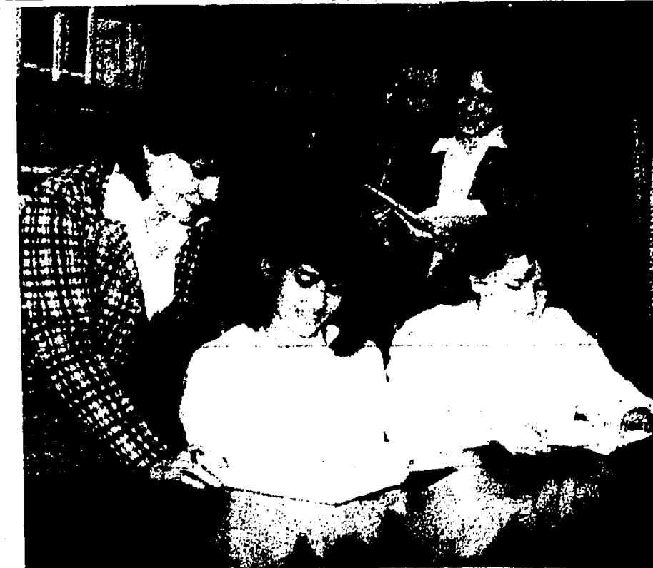
SCIENTIFIC RESEARCH - Students from Mother Seton Regional High School in Clark received first-place recognition in a chemistry competition...