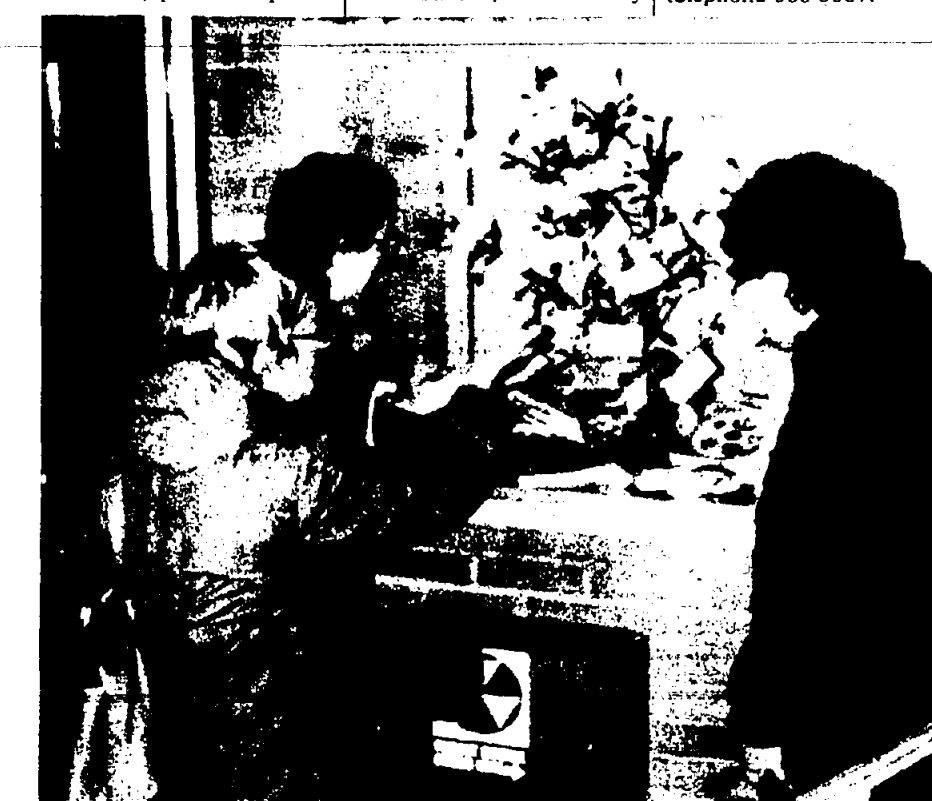
TRIBUTE TO LEADERS - Members of the Clark-Winfield Girl Scout Scout stop to admire the 'Salute to Girl Scout Leaders' in one of the entrance showcases at the Clark Public Library...