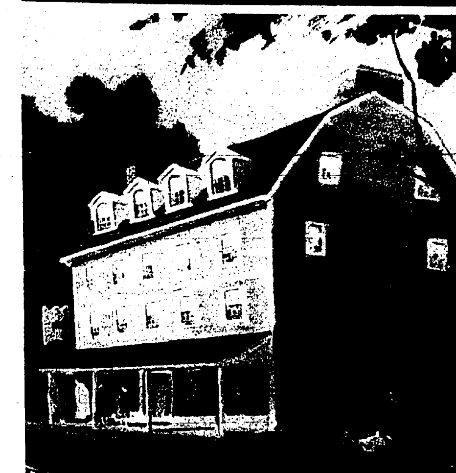
HISTORY ON DISPLAY - The Merchants & Drivers Tavern at Liberty Square-St. George and Westfield Aves. will be the site of the Rahway Historical Society's Open House and Museum Day...