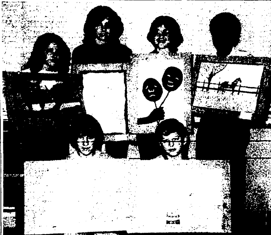
ARTWORK ON EXHIBIT - Seven students from Clark's Charles H. Brewer School were selected to have their artwork exhibited...