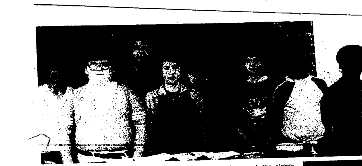
TOURNAMENT WINNERS - The Pinchers took the eighth-grade crown in the Rahway Junior High School Volleyball Tournament.