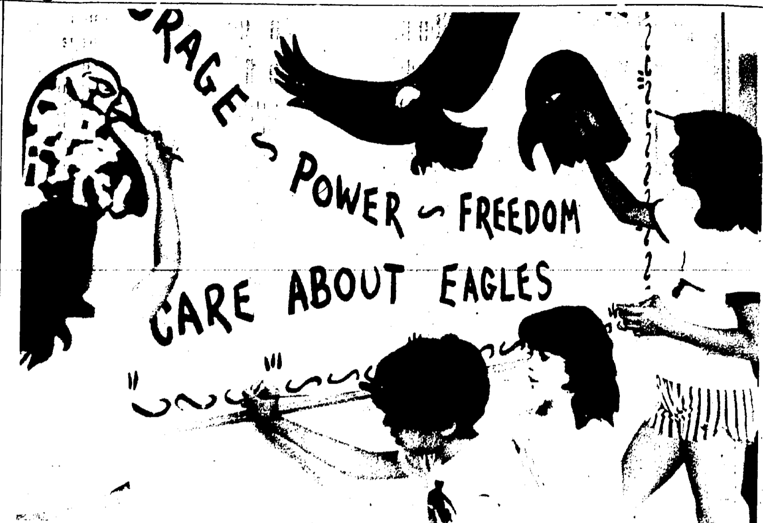
"WE CARE ABOUT EAGLES" - The fifth grade students at the Frank K. Hehly School in Clark are shown painting one of two school bulletin boards for the "We Care About Eagles" life science project. Ten school districts in New Jersey were involved in the study of our majestic, national bird. This life science project was sponsored by Columbia Savings and Loan of Fair Lawn, Columbia provided the Hehly School with the National Wildlife Federation's life science educational kit, which contained information on the eagle's life cycle, food chain, habitat and ecology.

This is the seventh year the Giants will play a pre-