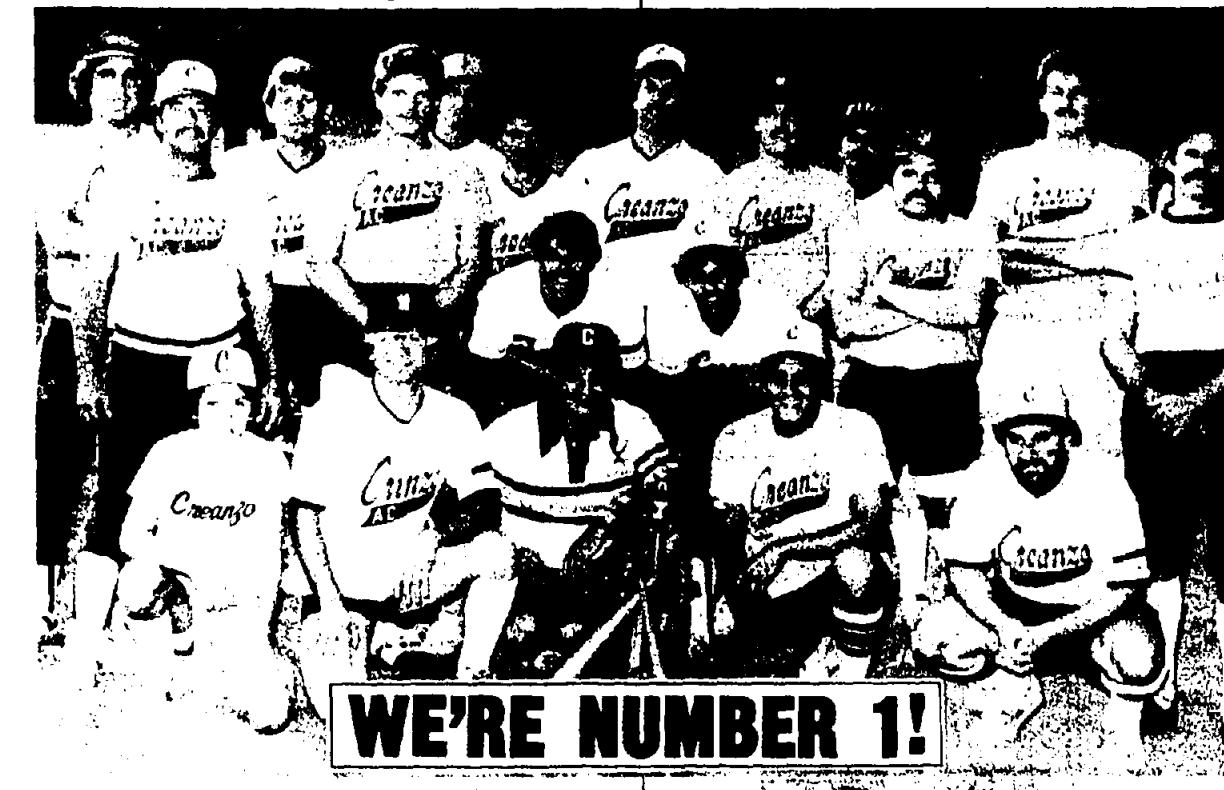
AFTER THE CROWNING... Members of Creanzo A.C., the 1983 Rahway Recreation Dept. Men's Slowpitch Softball League Western Division and league champions and Rahway Clark Mayor's Trophy Game winners, with a season's record of 19-2, smile over their victory.