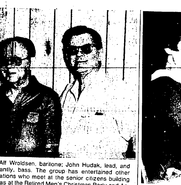
BACK IN TUNE...The Rahway Retired Men's Club quartet.