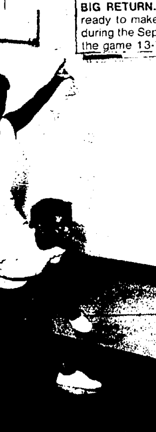
HURRAY FOR OUR TEAM! Rahway students show their style to a Rahway High School cheerleader during a recent clinic conducted at the city's junior high school.