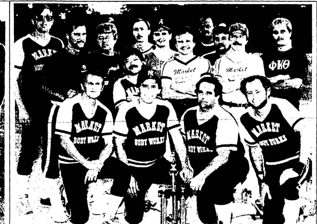
FINEST IN EAST... Members of Market Body Works, the 1983 Rahway Recreation Dept. Men's Slowpitch Softball League Eastern Division Champions, with a season's record of 20-4, display their trophy.