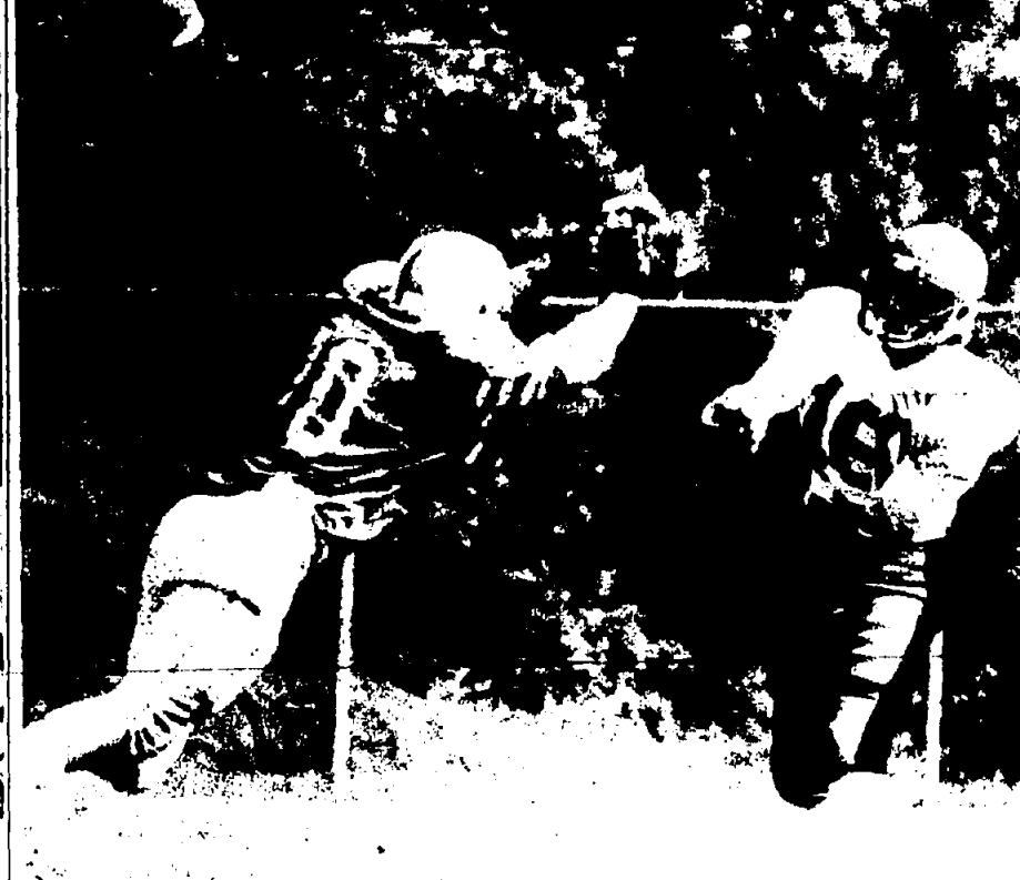
LEAP TOO LATE... Rahway quarterback, A. J. Gabel, No. 16, gets off a pass just before a Scotch Plains player blocks it during the Sept. 24 game.