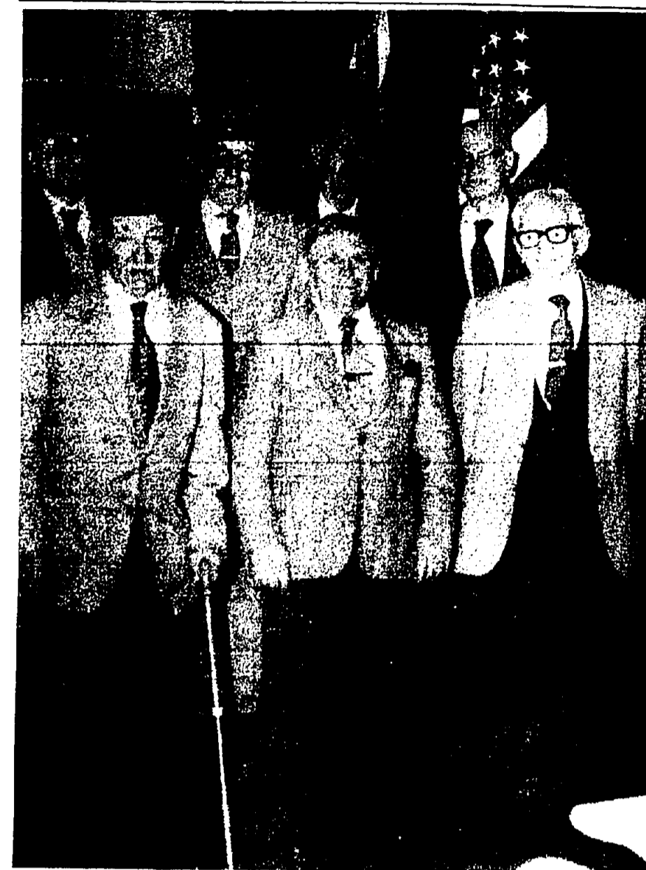
WELCOME TO DINNER - On Nov. 13 the Veterans of Foreign Wars of Rahway Post No. 1 681 and their Ladies Auxiliary members hosted their Annual World War I Dinner...