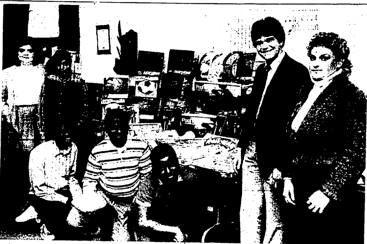
RAHWAY'S 'HAND-IN-HAND' - Youth organization presented sports equipment and games by Local No. 1262 of the United Food and Commercial Workers International Union...

This week is targeted as Employment Week for senior citizens in Union County. The announcement was made on Dec. 1 at a regular meeting of the Senior Citizens Council of Union County, N. J. Inc.