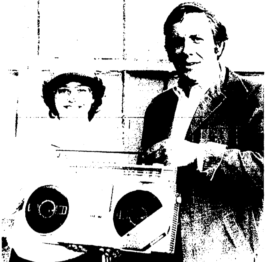
TUNING IN FOR REDSKINS - The members of the Rahway High School Band...