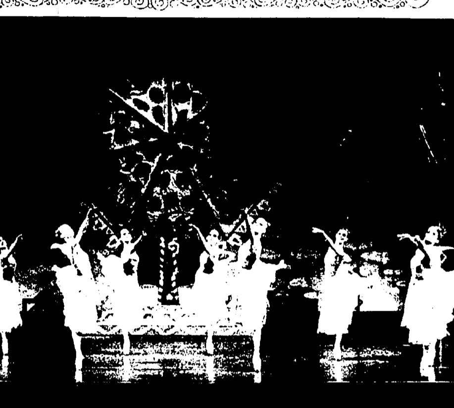
CHRISTMAS TRADITION - The New Jersey Ballet Company will present the "Nutcracker Suite" at the Paper Mill Playhouse in Milburn. Twenty performances will full ballet orchestra are scheduled from tomorrow to Friday, Dec. 30. Matinees will be at 3 o'clock and evening shows at 7:30 o'clock.