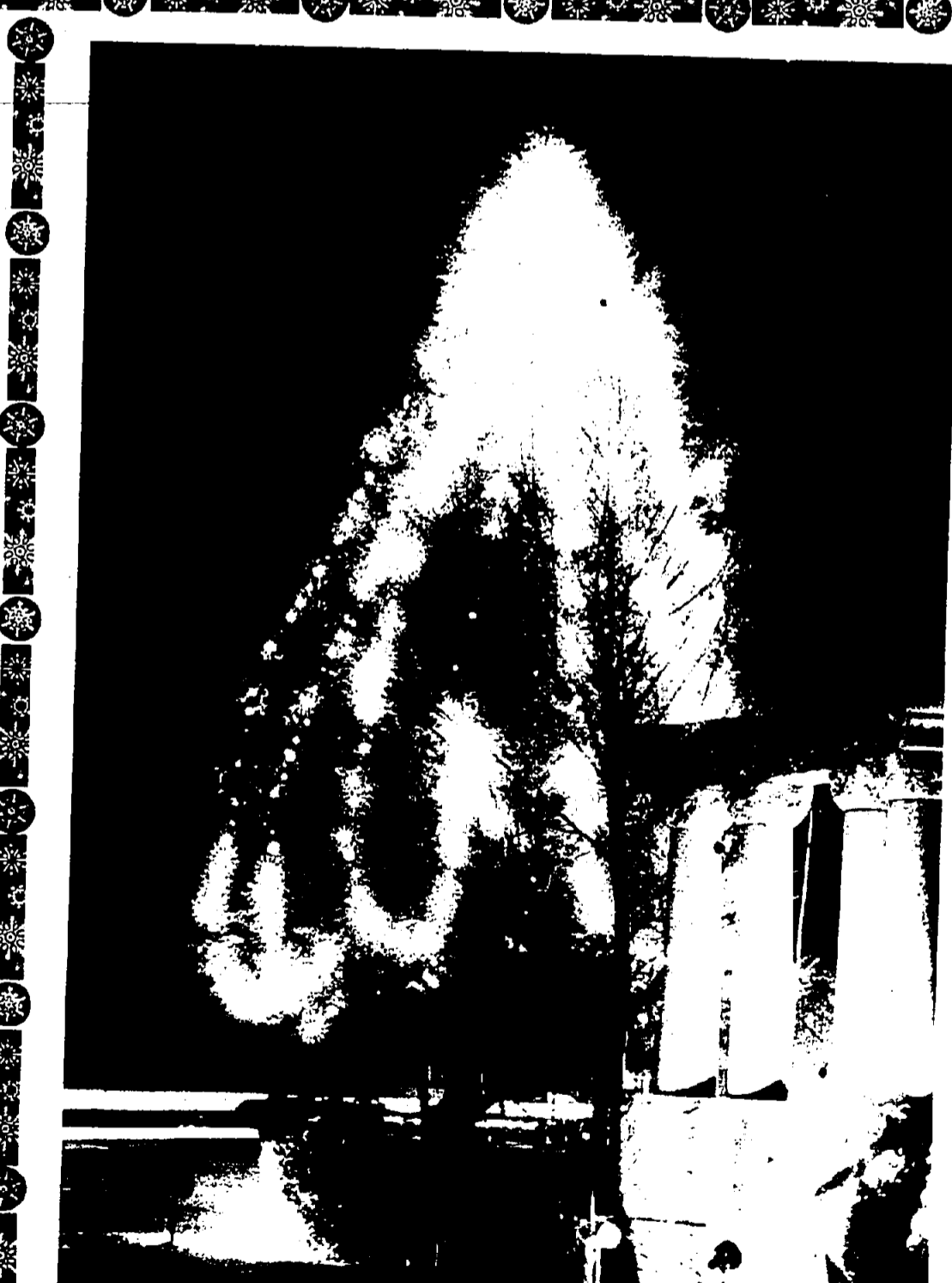
GRAND SIGN OF SEASON - This Christmas tree, at the corner of Grand and St. George Aves., Rahway, sponsored by the Rahway Chamber of Commerce, will have its official lighting today at dusk.