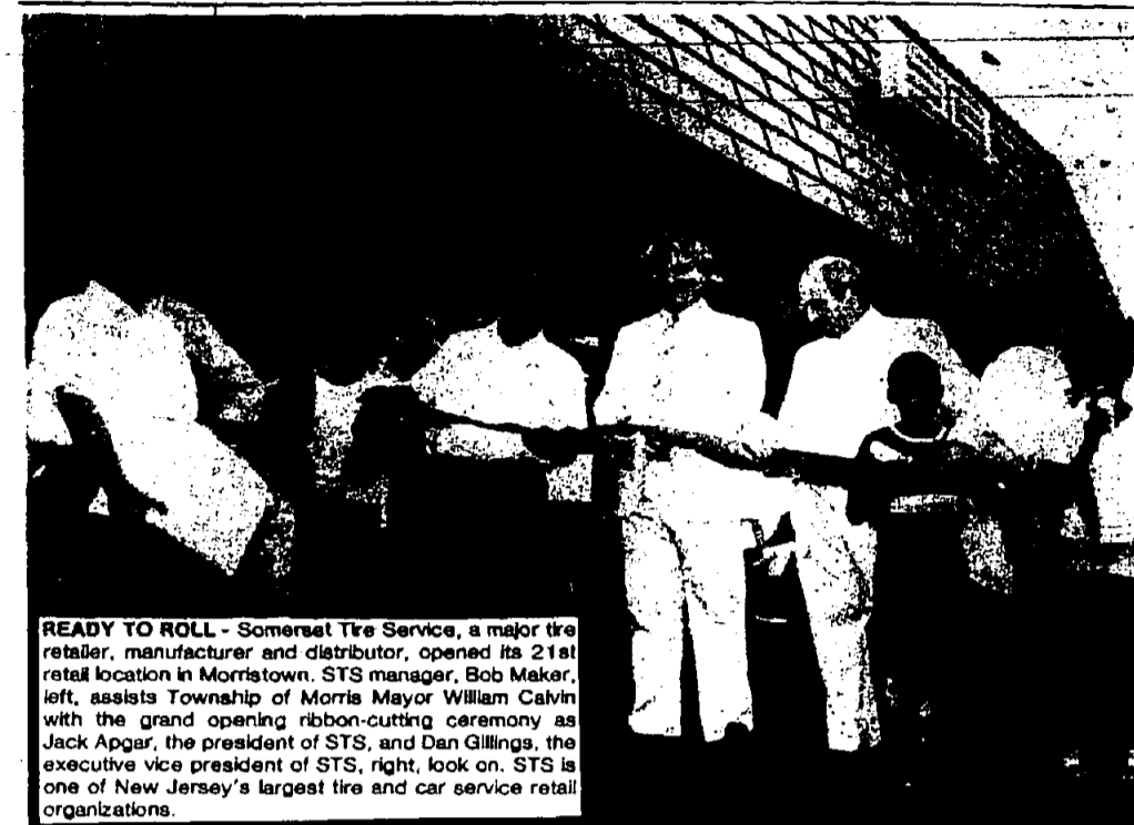
READY TO ROLL - Somers Tire Service, a major tire retailer, manufacturer and distributor, opened its 21st retail location in Morristown, N.J. on Tuesday. The new location is Morristown, N.J. The new location is Morristown, N.J. The new location is Morristown, N.J.