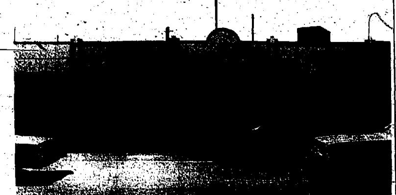
BEFORE... The renovation of a group of stores at the corner of Milton Ave. and Irving St., Rahway under the Main Street U.S.A. Program this is the way the property looked.