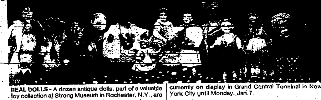
REAL DOLLS - A dozen antique dolls, part of a valuable collection at Strogen Museum in Rochester, N.Y., are currently on display in Grand Central Terminal in New York City until Monday, Jan. 7.