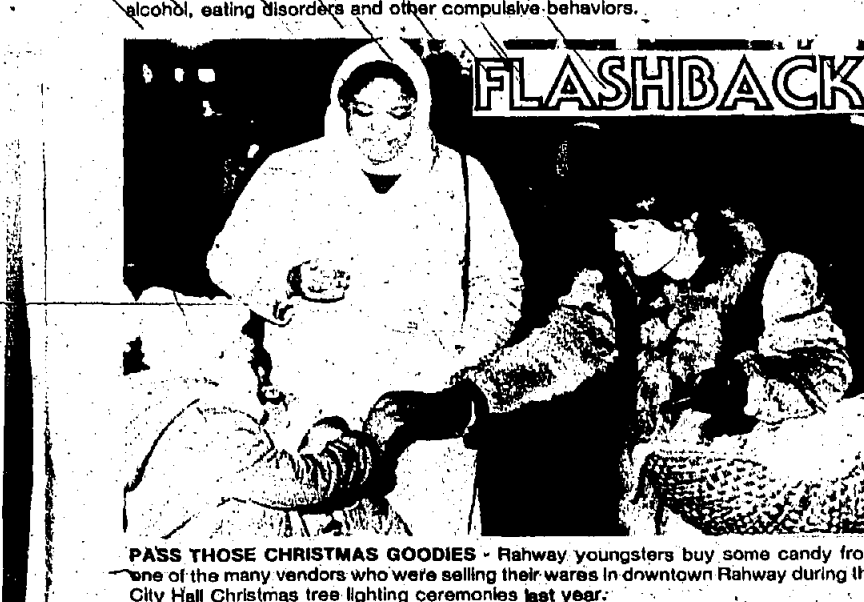
FLASHBACK - Rahway youngsters buy some candy from one of the many vendors who were selling their wares in downtown Rahway during the City Hall Christmas tree lighting ceremonies last year.