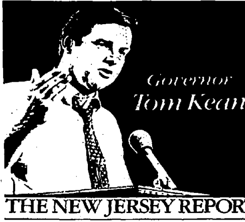
THE NEW JERSEY REPORT