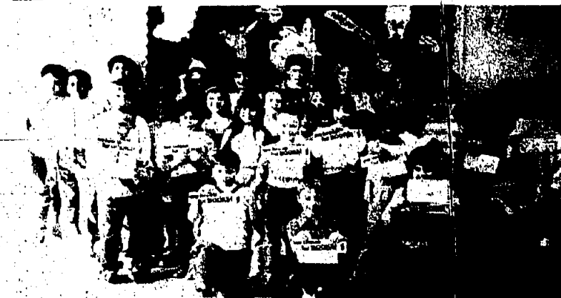
BOOK BOOSTERS ... Students in the "In Celebration of Reading" program at Rahway's Grover Cleveland School display the bumper stickers they received for participating.