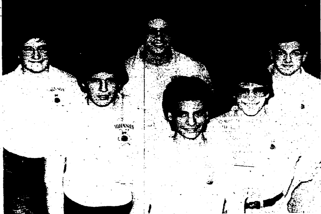
ROLLING ON TOP... Members of Clark's Arthur L. Johnson Regional High School Bowling Team smile with pride after winning the first state championship in the school's 28-year history on March 9.