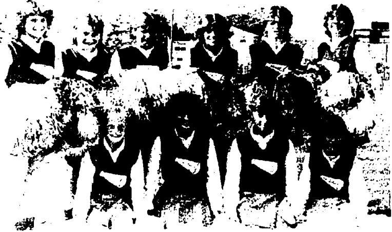
HURRAY FOR OUR SIDE... The Clark Pop Warner Football Cheerleaders are shown at a game last year. Registration for the squad for this year will be held on Wednesday, April 3 from 7 to 8 p.m. at the Clark Crusaders Clubhouse (behind Friendly's.)