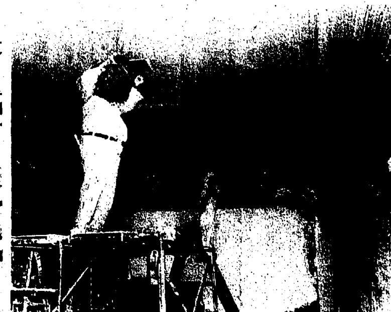
GETTING THERE...Workers' pneumatic now dominate the space that will hopefully be occupied by wall-to-wall by patrons of the arts at the Rahway Theatre in the very near future.

The initial work completed in February included the reconstruction of damaged walls and ceilings as well as fresh plastering. This was preceded by a "demolition" phase in which volunteer members of Rahway Landmarks, the theatre's new owner, stripped away all the false walls, floor tiles and other material that had been added by various operators over the years.