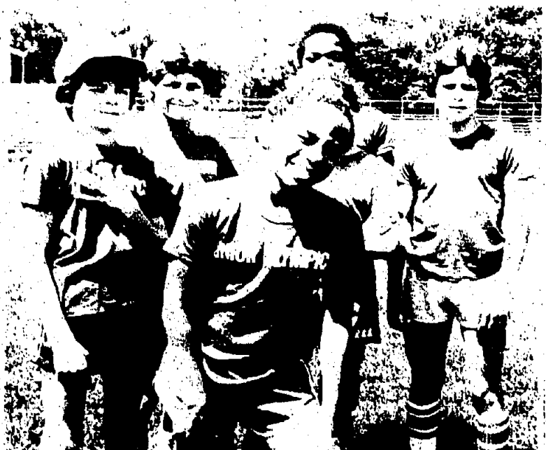
ON THE RUN ... Members of last year's Rahway Recreation Dept. Amateur Athletic Union Junior Olympic Track and Field Team, the state finalists, are shown in New Providence. This year's A.A.U. Junior Olympics Track and Field meet will be held on Saturday, April 27. Rahway boys and girls who are under nine years of age, starting with second graders and did not reach their 14th birthday prior to Jan. 1, 1985 are eligible. For information please telephone the recreation department at 381-8000-extension 322.

-Okayed the insertion of $35,392 in the budget from the Public Health Priority Funding Act of 1977 from health services provided to