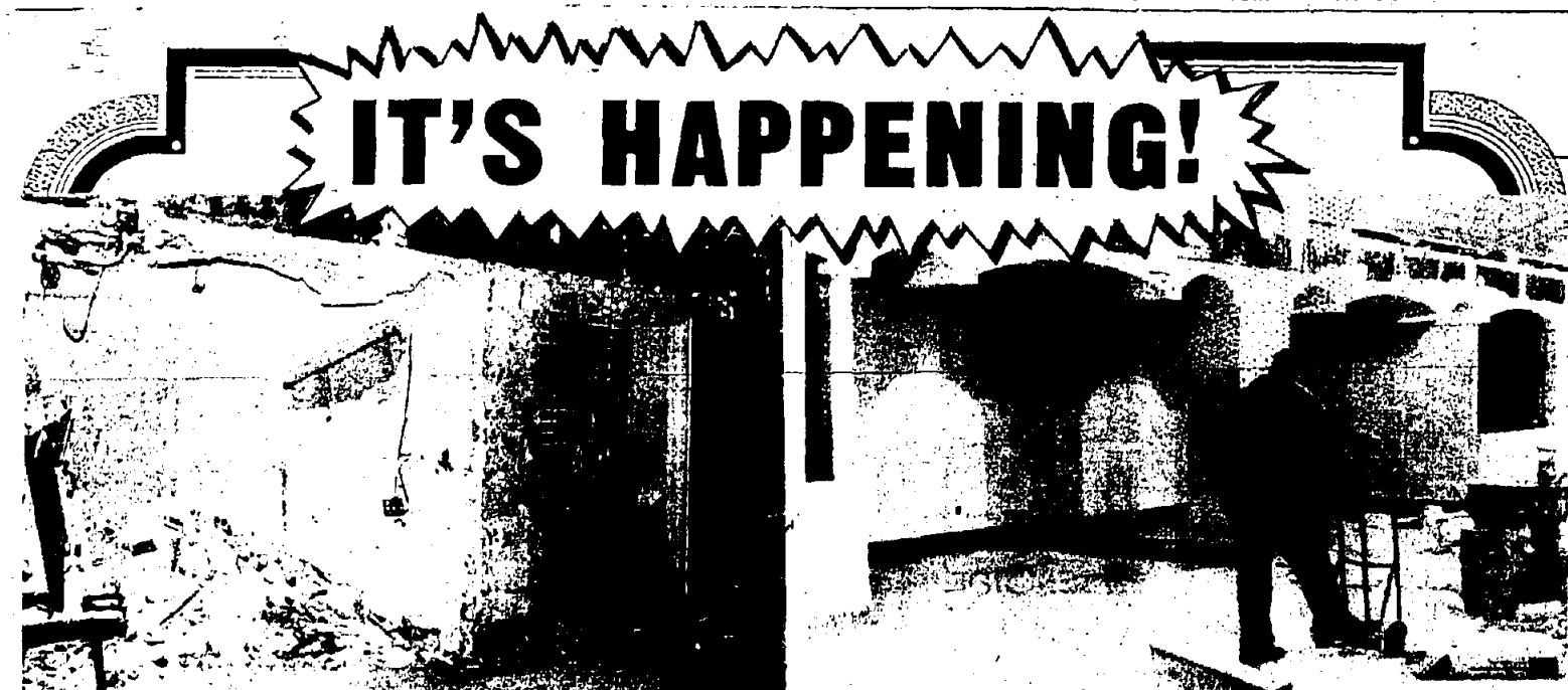
BEFORE - This is one of the walls in the old Rahway Theatre before reconstruction started on it to make way for what will become the Union County Arts Center.