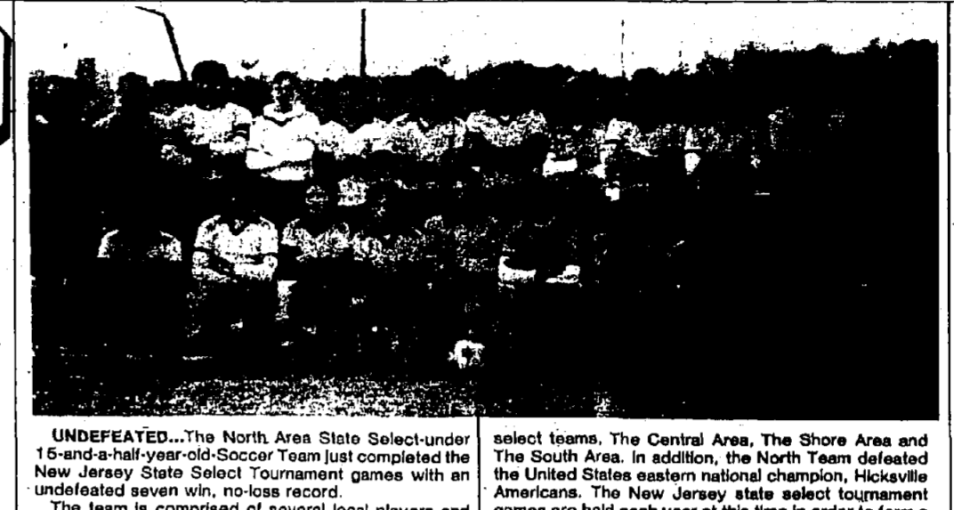
UNDEFEATED...The North Area State Select-under-16 and a half-year-old Soccer Team just completed the New Jersey State Select Tournament...

Pru-Bache opened the 1985 Clark Babe Ruth baseball season by chalking up two victories.