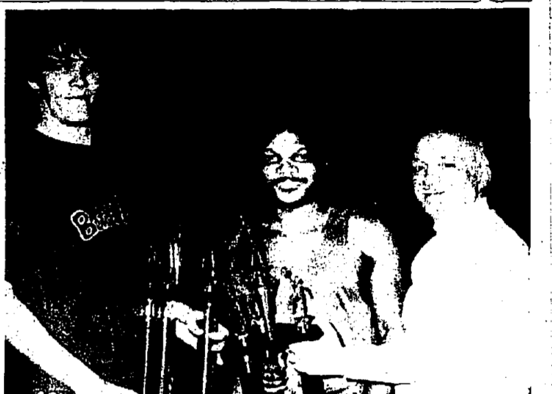
CROWNING GLORY...After several seasons of almost winning the title the Y's Guys won the "big game" when they outscored the defending champions, Kowal's, 73-65...

enjoy Nature's Best FRUITS & VEGETABLES from GREEN FARMS