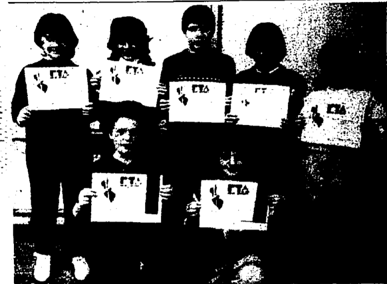
MARVELOUS MUSICIANS...Displaying the awards for cultural enrichment in music...