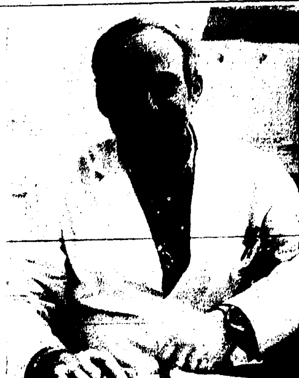
NEW REHAB ADMINISTRATOR JOINS RAHWAY HOSPITAL STAFF.

can make a big difference in cancer control.