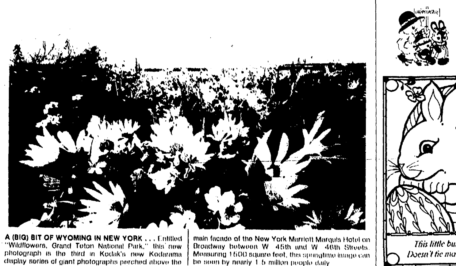
A (BIG) BIT OF WYOMING IN NEW YORK... Entitled "Wildflowers, Grand Teton National Park," this new photograph is the third in Kodak's new Kodachrome display series of giant photographs printed above the main facade of the New York Marriott Marquis Hotel on Broadway between W 46th and W 48th Streets. Measuring 1600 square feet, this amazing image can be seen by nearly 1.5 million people daily.