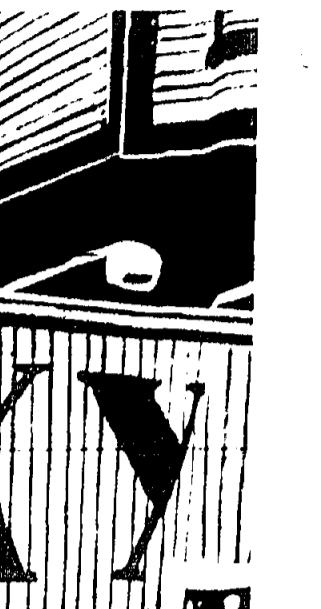
WOMAN'S CLUB HONORED... The American Legion Auxiliary Officers Installation was held at the convention...