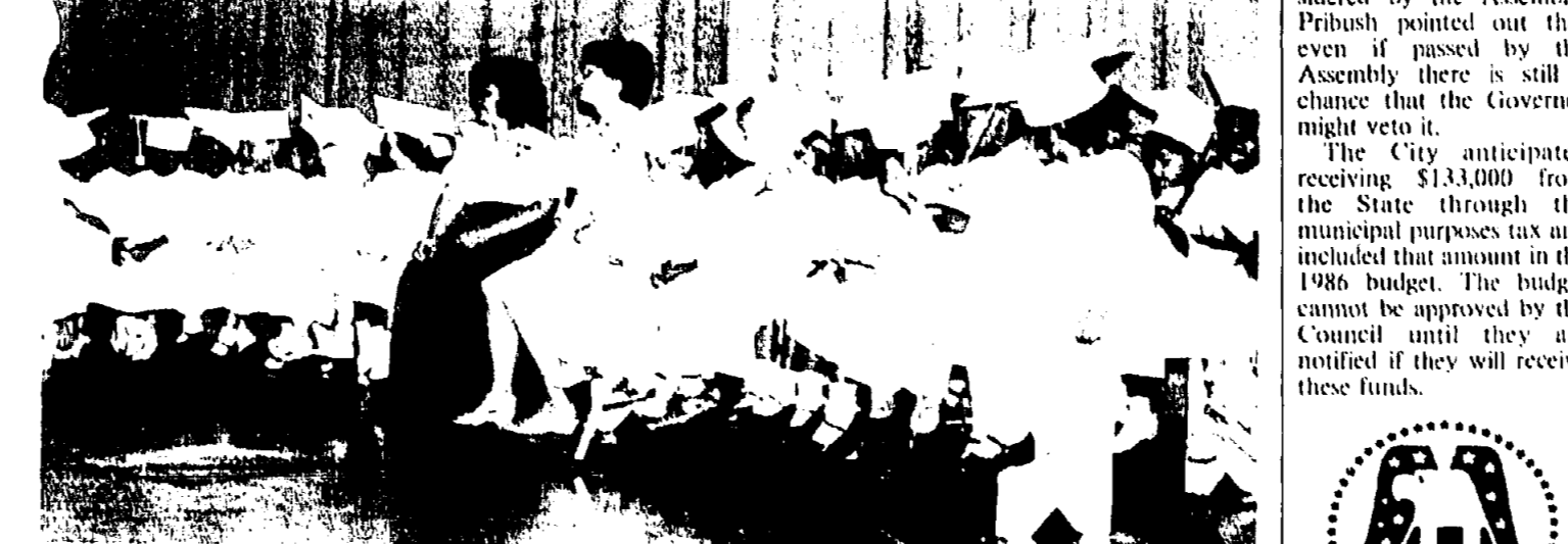
YOUNG GRADS... 29 children graduated from Rahway Day Care Center on Friday, June 20, and will be entering kindergarten in the fall. The children received diplomas for their achievements. For information on the center, phone 382-0644.