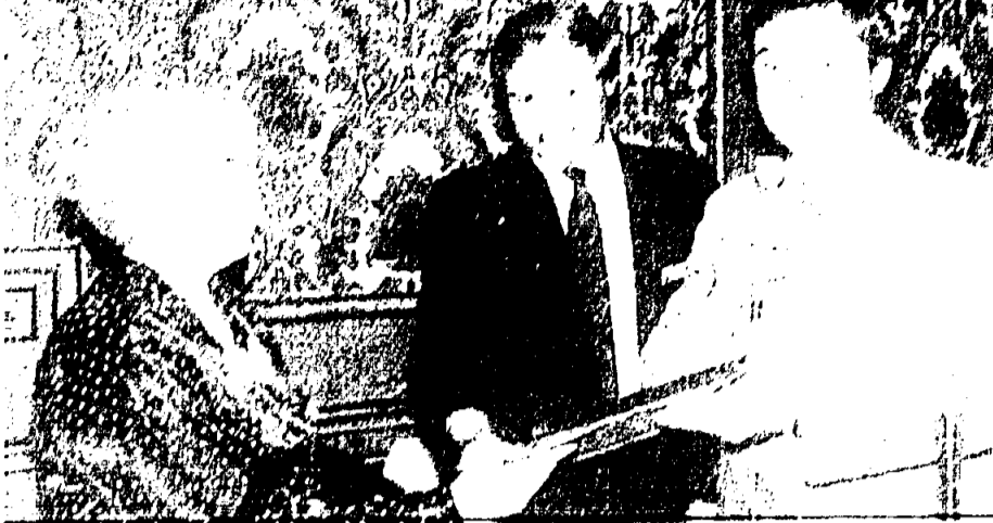
DEDICATION RECOGNIZED... A special award was presented to the patients at Rummells Hospital...