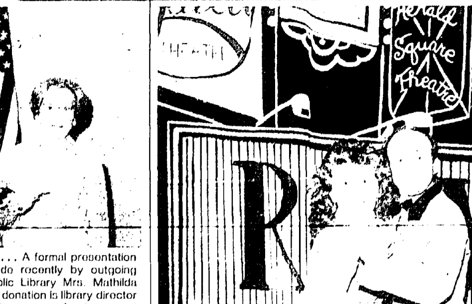
FRIENDS DONATE BOOKS... A formal presentation of a SAGO check was made recently by outgoing Friends of the Rahway Public Library...