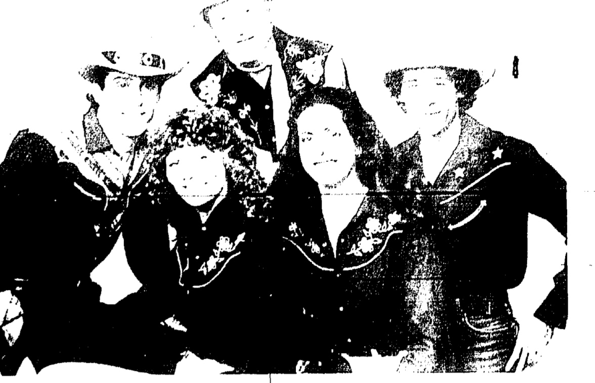
FOOT STOMPIN' PERFORMERS... Country Jubilee will perform at the Monmouth County Fair on Saturday.