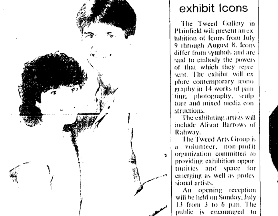
Tweed to exhibit loons