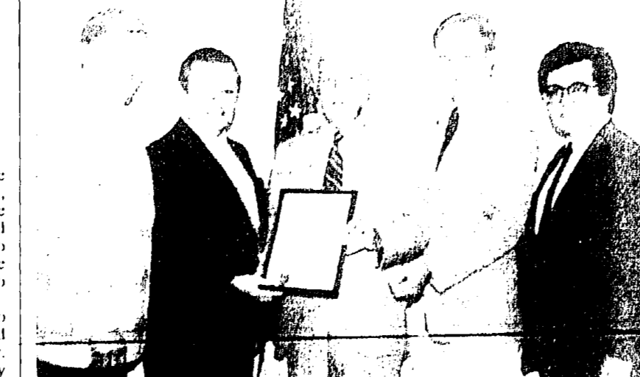
UNION COUNTY FREEHOLDERS HONOR POLICE PISTOL TEAM... The Union County Board of Chosen Freeholders, recently honored the Elizabeth Police Pistol Team...