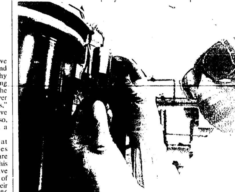
FIRST GENETICALLY ENGINEERED VACCINE . . . A Merck scientist draws a sample from a small fermentation unit used in the development of the Recombinax HB, the first genetically engineered vaccine for human use in the U.S.