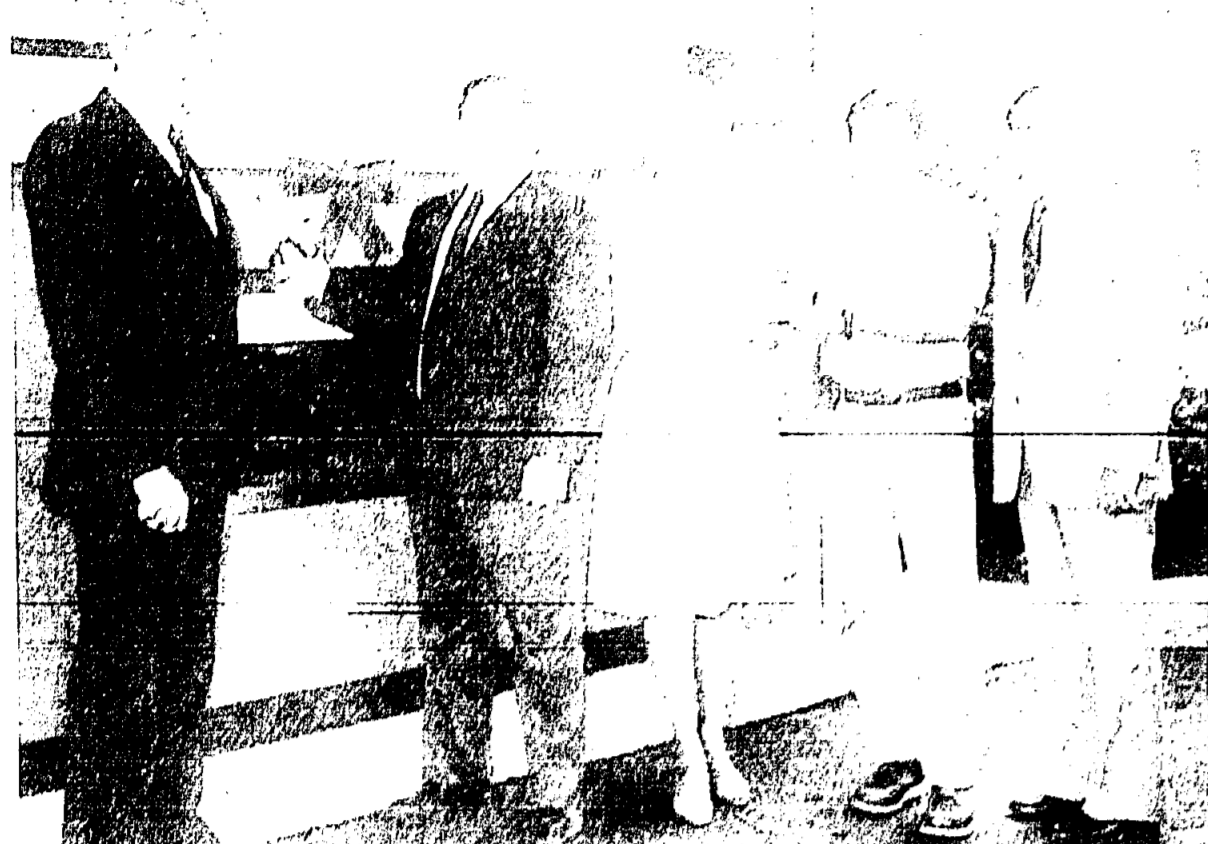
MAC TAKES A BROW... A group of people gathered around a large machine, likely the MAC machine mentioned in the text.