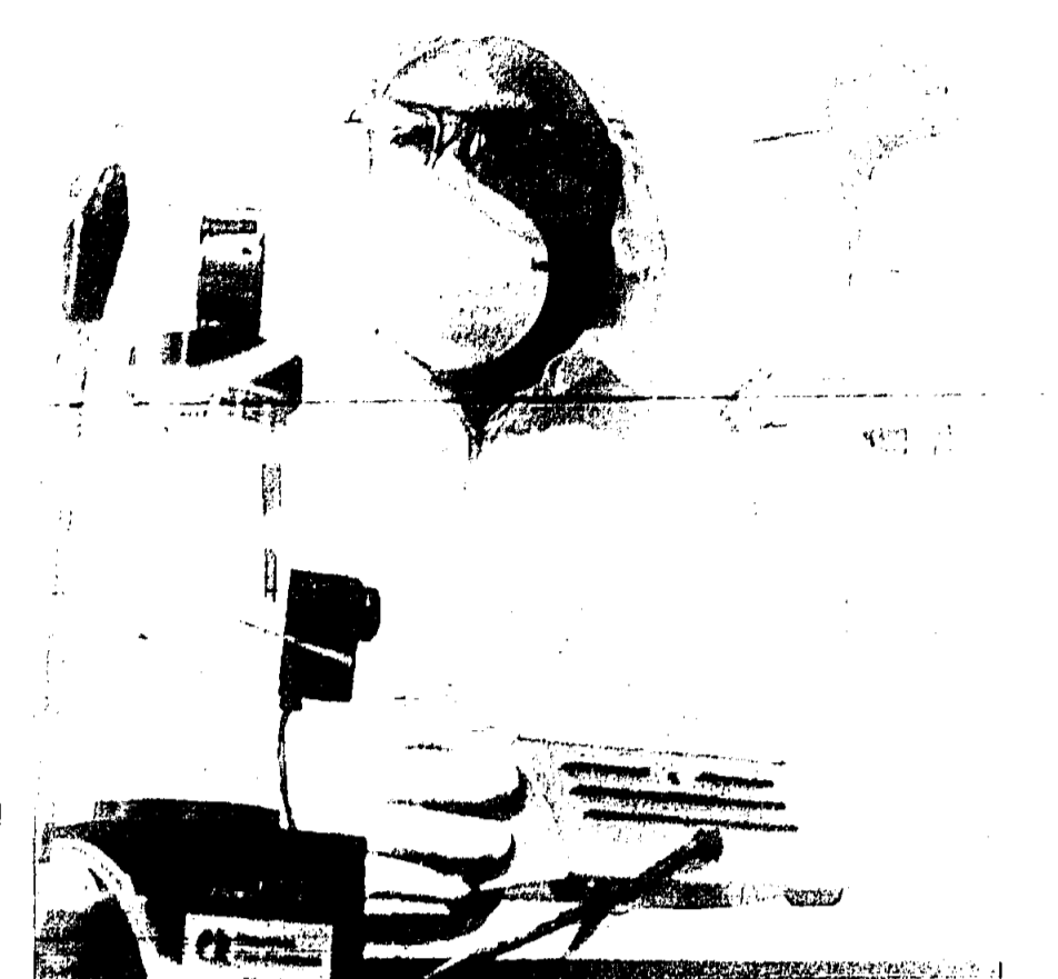
CHROMATOLOGY COLUMN INSPECTED... A technician at the Newark Shipyard...