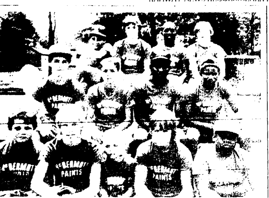
VICTORS... The American League Champs and Junior Runners-up at the Rahway Summer Playground softball league are pictured at Flamingo Field.