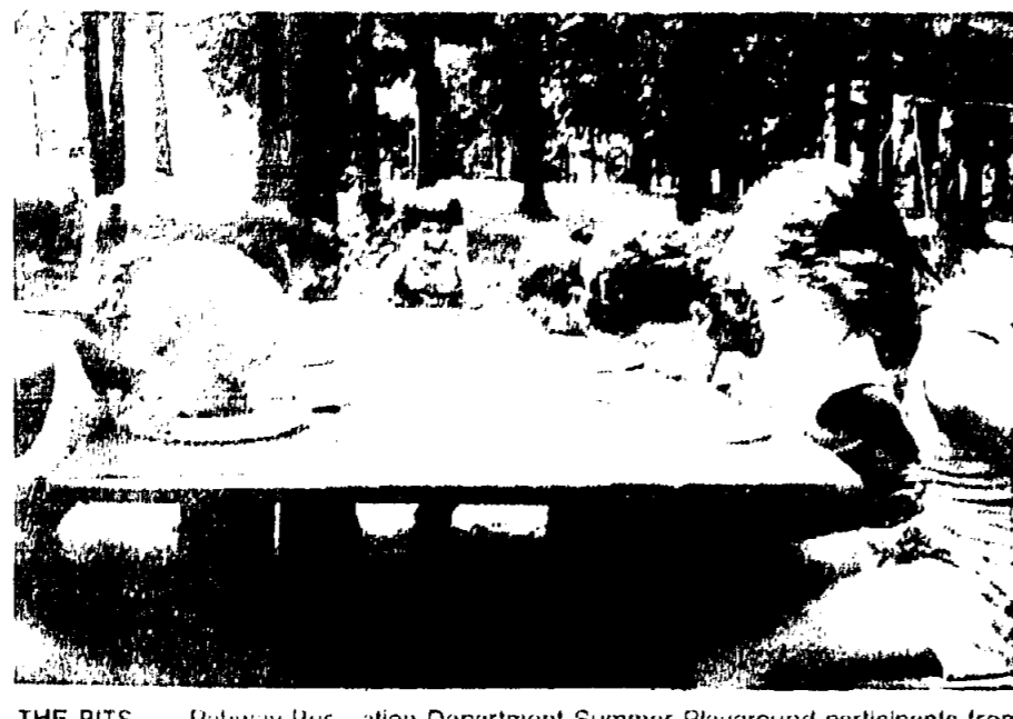
THE PITS... Rahway H.C. allows Department Summer Playground participants from Clifton Field to participate in a watermelon eating contest held in August.