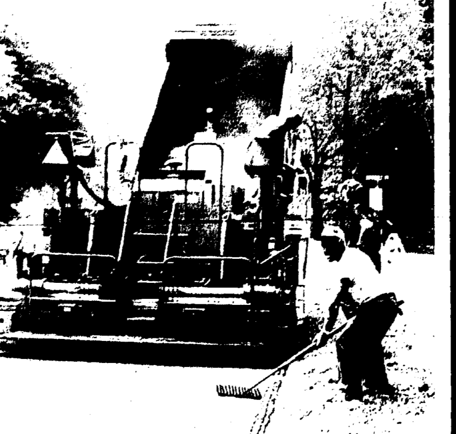
RESURFACING UNDERWAY... The Super 8s of the Union County Department of Public Works recently finished resurfacing and repaving a three-quarter mile stretch of Gullwing Hill Rd.