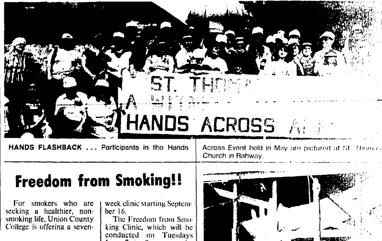
Hands Across America ... Participants in the Hands Across America event held in May are pictured at St. Thomas Church in Rahway.