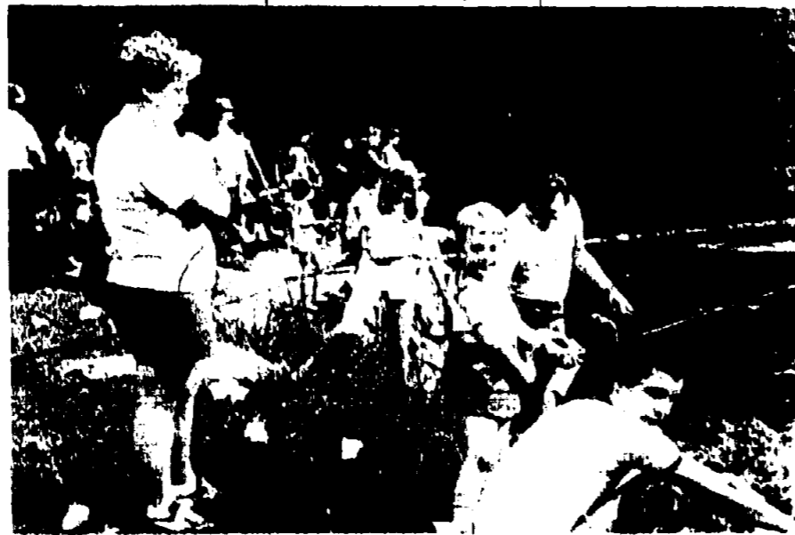
IN THEIR GLORY... Participants are pictured at the fishing derby. Approximately 300 youngsters took part in the annual event held at Milton Lake Park.