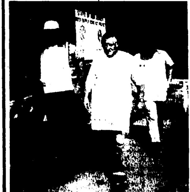
UNION PROTEST... Members of the International Union of Operating Engineers, Local 825, have been picketing the city's Westfield Ave. water pumping station in protest of the hiring of non-union workers to construct a 500,000-gallon water tank.

There have been several incidents of violence, and some arrests, at the job site. Capt. George Malsam of the Rahway Police Dept. said between 8 and 10 police officers are assigned to the Westfield Avenue location each day, often being pulled from other duties. "They are there to preserve peace, protect property and to arrest offenders," said Capt. Malsam.