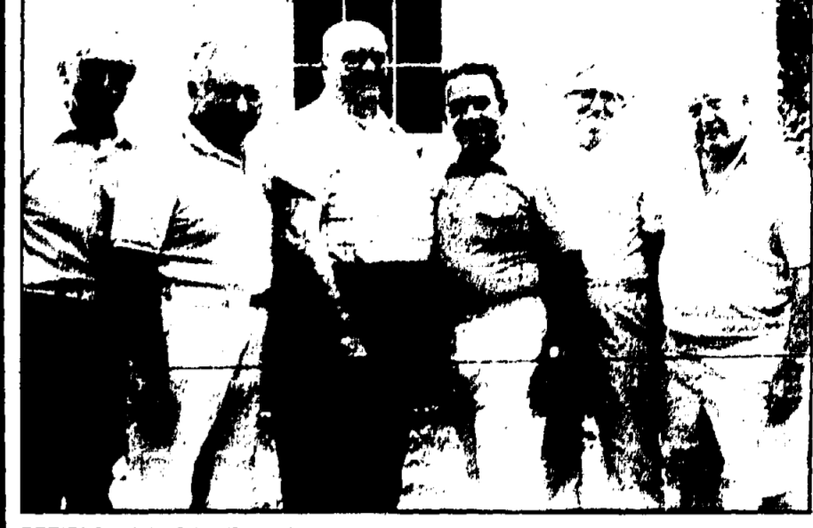
RETIRE RAILROADERS PICNIC... The Rahway Retired Railroaders Club held their annual summer picnic on Thursday, August 14, at the Senator Cicco Building on Edinboro Ave. Pictured are the members of the picnic committee...