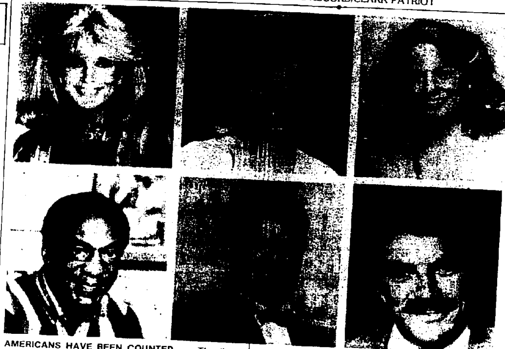
AMERICANS HAVE BEEN COUNTED ... The three favorite female and male television performers as determined by a special Gallup Poll are from the top (l-r) Linda Evans, Phylcia Rashad and Cybill Shepard. From the bottom (l-r) Bill Cosby, Bruce Willis and Tom Selleck.