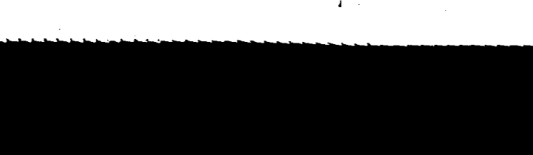
New York receives more spices than any port in the world.