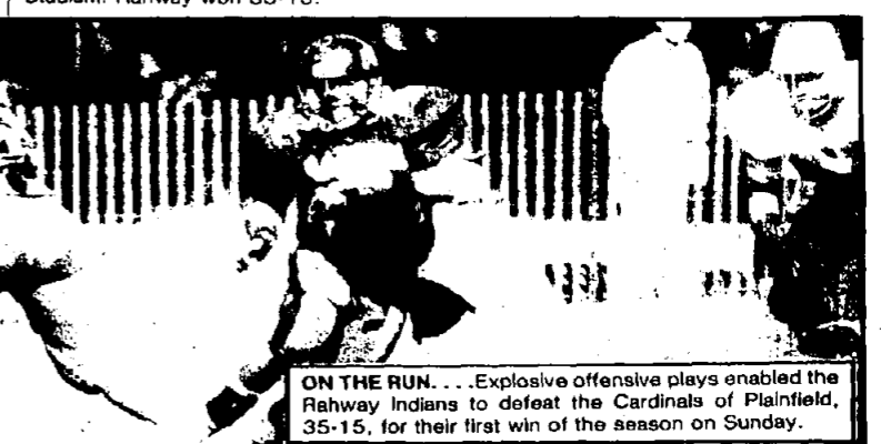
ON THE RUN... Explosive offensive plays enabled the Rahway Indians to defeat the Cardinals of Plainfield, 35-15, for their first win of the season on Sunday.