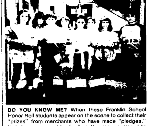
DO YOU KNOW ME? When those Franklin School Honor Roll students appear on the scene to collect their "prizes" from merchants who have made "pledges," their faces may not be familiar. Vendors are urged to check for the "Blue and Gold Merit Card." The youngsters "never leave home without it."