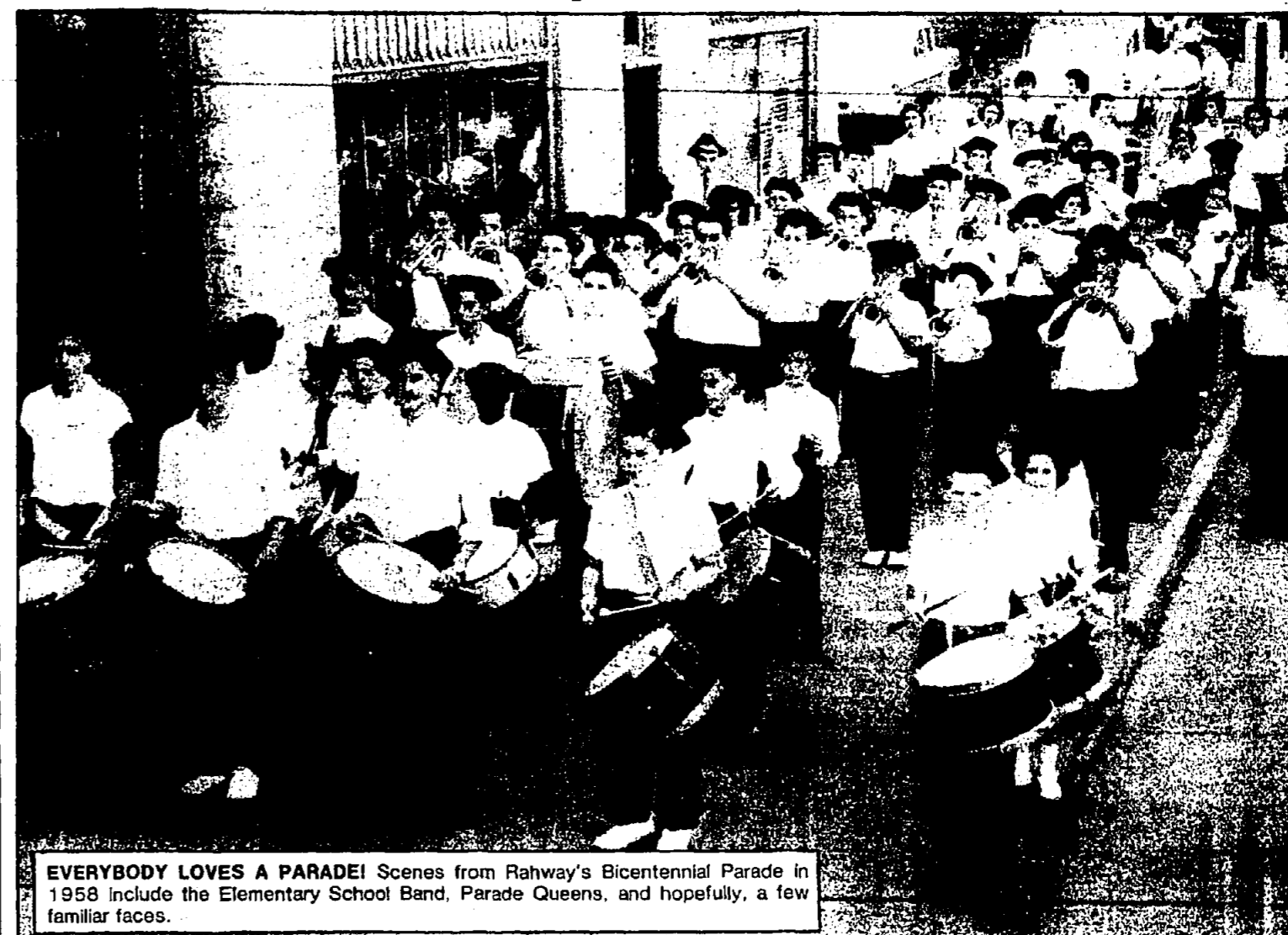
EVERYBODY LOVES A PARADE! Scenes from Rahway's Bicentennial Parade in 1958 include the Elementary School Band, Parade Queens, and hopefully, a few familiar faces.