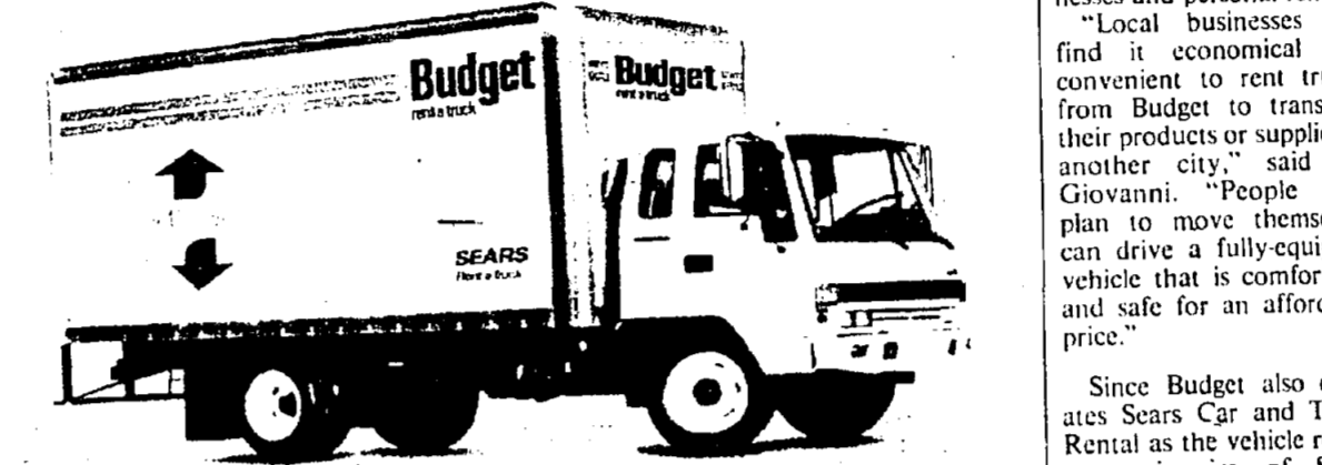
HANDLES LIKE A DREAM... This 24-foot-high cube Budget truck has all the creature comforts...

Budget Rent a Truck of Linden, now offers renters a fleet of fully equipped trucks for one-way rentals as part of the Budget national one-way truck rental program.