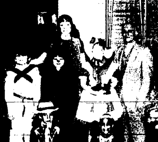
A LITTLE LATE, BUT... Everybody celebrates Halloween in October - everybody, that is, except the Rahway Recreation Dept. which waited until just a few weeks ago to have their Halloween party for youngsters in the roller skating program...

Death Valley, in southeast California, is 282 feet below sea level. It is a kernel of popcorn when dropped on a neutron star, it would produce as much energy as a World War II atomic bomb.