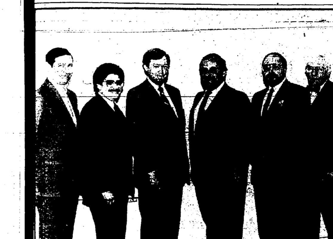
ERA Realtors launch MD drive. Brokers and sales associates from ERA Village Green Real Estate in Clark and across the country were joined in a door-to-door fund-raising campaign on Saturday, May 7...