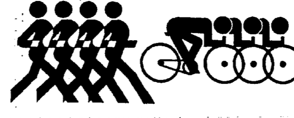
***** COACH'S CORNER *****