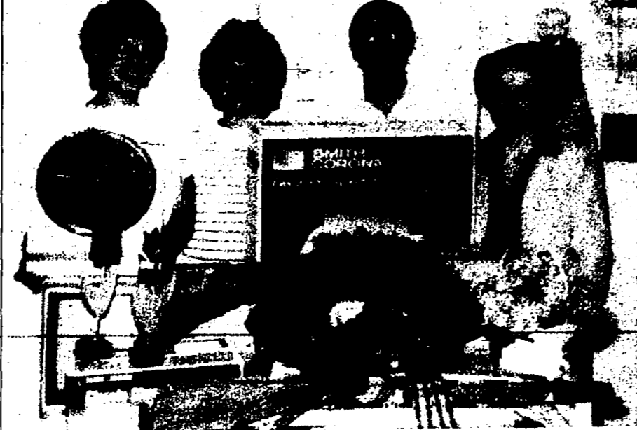
AUCTION ACTION... Linden Cub Scout Pack No. 30 of St. John the Apostle Church, Linden, Clark will hold its 13th annual Chinese Auction at Roselle Catholic High School on Friday, September 23.

The Young Single Catholic Adults Club (for singles between ages 21-35), which held its general meeting on Tuesday, September 20, at 8 p.m. at the Immaculate Conception R.C. Church.