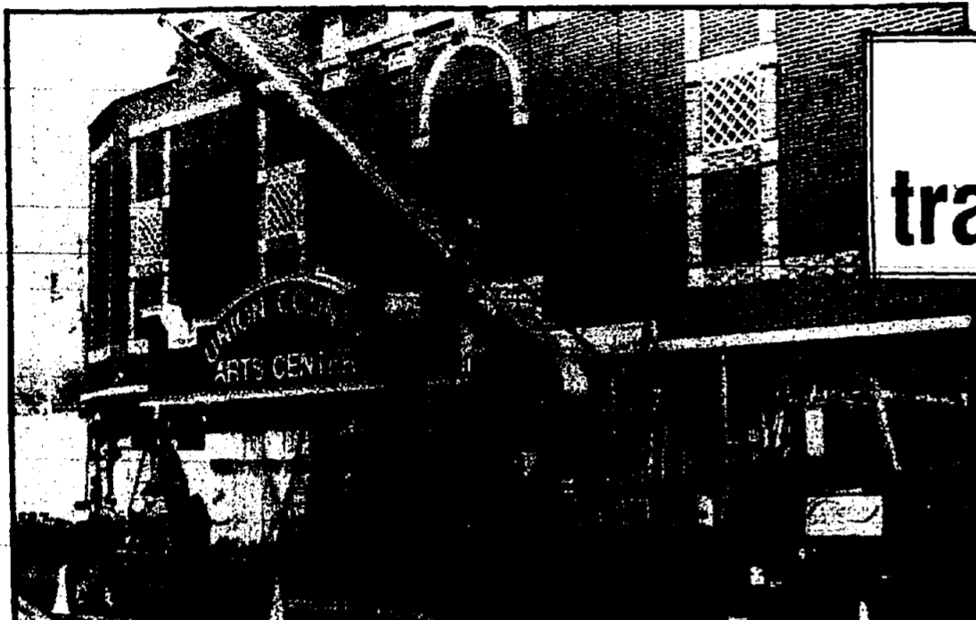
FACELIFT . . . The former Rahway Theatre on Rahway's Irving St. undergoes a dramatic transformation with the addition of its brand new marquee. The 60-year-old former vaudeville theatre was officially renamed Union County Arts Center in 1985.