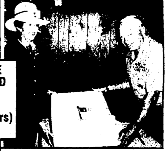
ICING ON THE CAKE... General and Mrs. Alfred Gray show delight at the Mulvey-Ditmars VFW Post's sweet welcome upon the General's return to Rahway — his former home — to be Grand Marshal in the May 28 Memorial Day Parade.