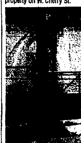
ILLEGAL ENTRY ... A&M's Cherry St. residential neighbors say this rolling gate truck access is illegal.