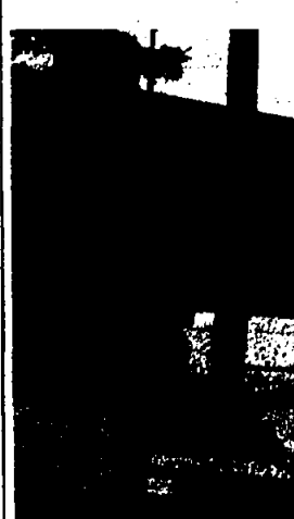
WIDE MANEUVER ... 18-wheeler maneuvers through gate onto A&M Industrial Supply Co. property on W. Cherry St.

Some of the complaints residents have are that A&M violates zoning ordinances by having 16 parking spaces where only 10 are permitted, a rolling-gate fence on Cherry Street where only a chain-link fence is permitted, and the use of West Cherry Street for deliveries when ingress and egress is permitted only for Campbell Street.