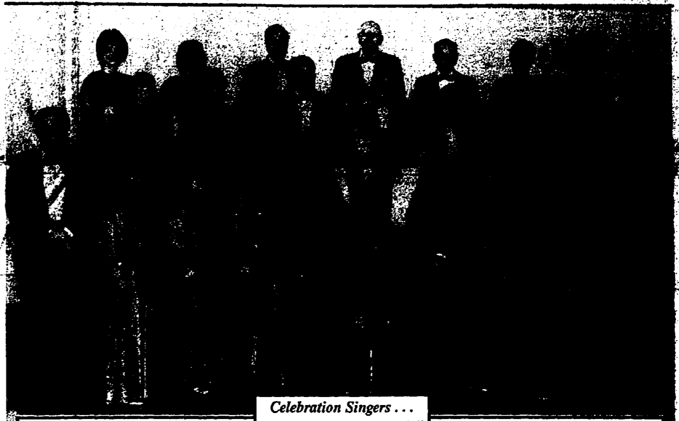
Celebration Singers . . .

Since 1891, Salvation Army kettles have helped make Christmas a time of joy for those in need. This holiday season, when you pass by a kettle, be generous and help The Salvation Army help those who cannot help themselves. Let Christmas be a time when ALL can rejoice!