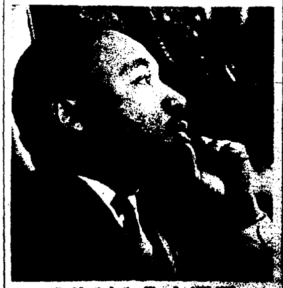
Dr. Martin Luther King, Jr., 1968-1969

For King, the pinnacle of public recognition came in 1964, when he received the Nobel Peace Prize, given annually to the individual who has contributed most to the "furtherance of peace among men."