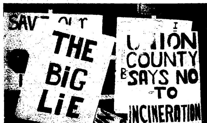
SIGNS OF THE TIMES - Anti-incinerator protest signs are stacked up outside City Council Chambers during Council meeting. Moratorium on building resource recovery plant was withdrawn, and Council concurred with Mayor Jim Kennedy's appointments to Union County Utilities Authority who were rejected two weeks earlier.

Attorney rules holdup would invite lawsuit