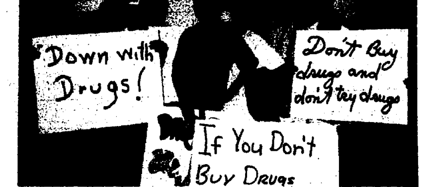
A MATTER OF SAFETY... Residents of Capobianco Plaza and Leesville Avenue housing units, mostly children, demonstrate concerns over incidents of shooting violence at their complexes by carrying signs into City Hall.