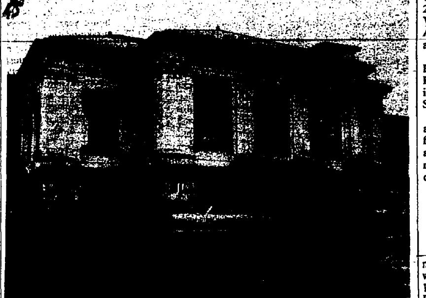
RAHWAY RAILROAD STATION IN BETTER DAYS