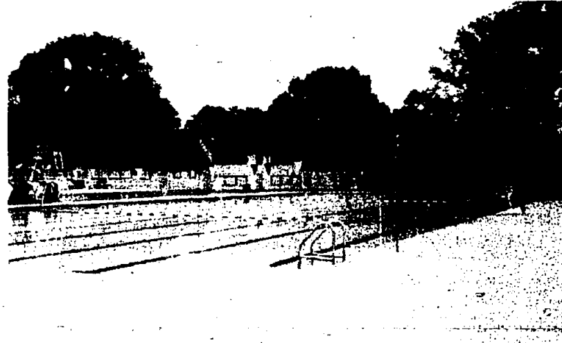
The Walter E. Ulrich Memorial Pool.