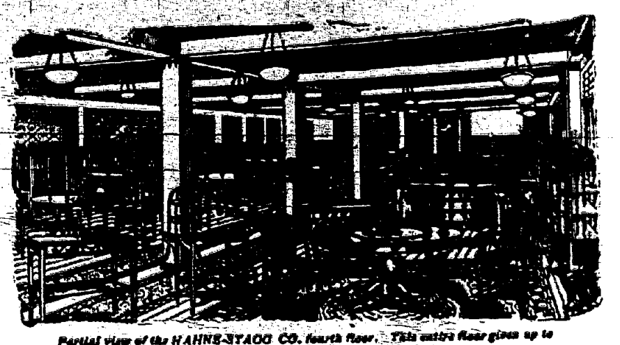
Partial view of the HAHNE-STAGG CO. fourth floor. This picture shows glimpse into the display of Dining-Room Sets.