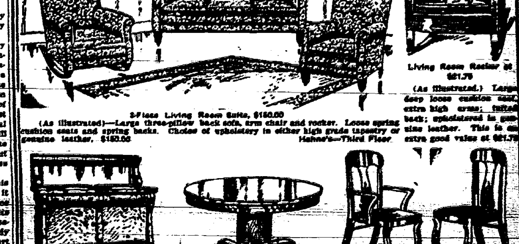
Living Room Seater $67.50 (As Illustrated) Large deep lounge cushion seat, extra high spring, upholstered in leather. This is an extra good value at $67.50.

You make no mistake in buying Hahne Furniture. It is the satisfying kind.