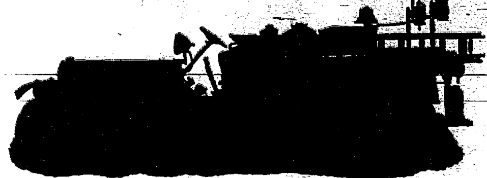
NEW BELMONT AMERICAN LA FRANCE FIRE ENGINE.

of $12,577 for work done by the department in repairing a sidewalk. The letter follows: