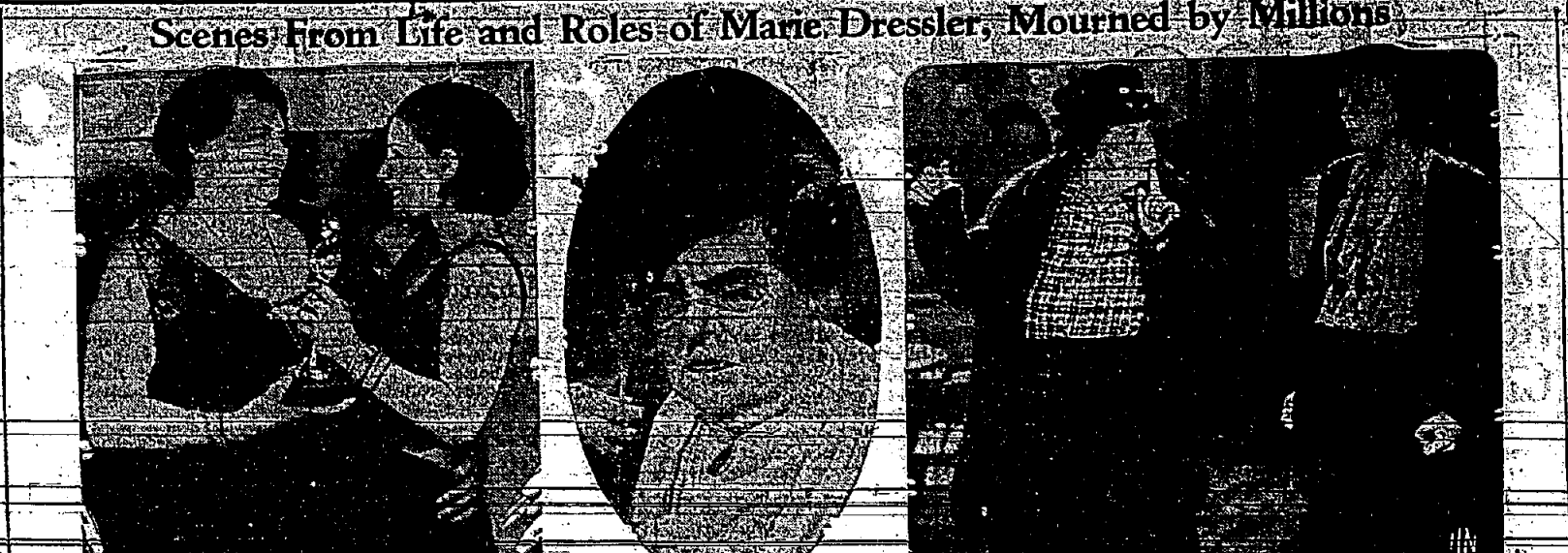
Scenes from Life and Roles of Marie Dressler, Mourned by Millions. Through the whole world means the passing of Marie Dressler her great spirit will continue to live in the films which brought her international fame.

Rotary Club Plans Golf Tournament. Qualifying Matches To Be Held August 20th At Locust Grove.