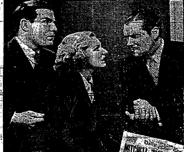
Naï Fendleton, Jean Arthur and Jack Holt in "The Defense Rests" Ritz theatre film attraction.