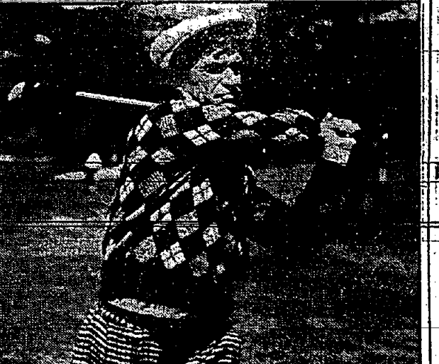
Will Rogers in "The Defense Rests" Ritz theatre film attraction.