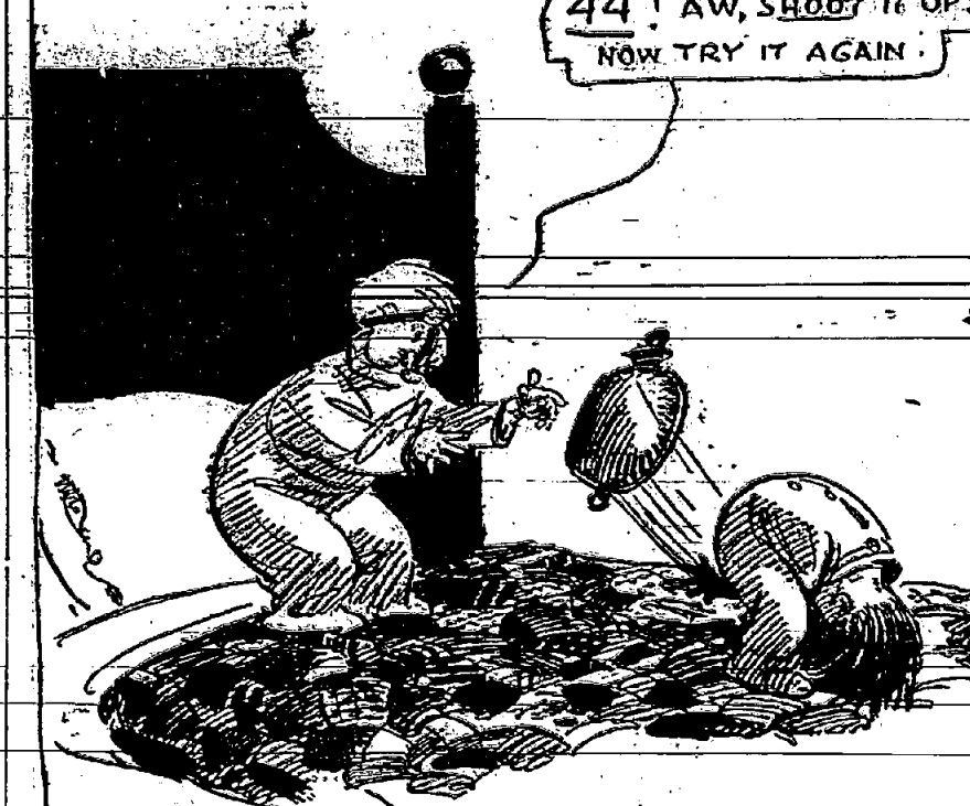
MOTHER JUST COULDN'T BEAR TO LET THE BOYS SLEEP IN THAT COLD ROOM WITHOUT A HOT WATER BOTTLE

SIGNALS 47-2-9-8 10-X-Y-Z-R-T-U-F-Z 44! AW, SHOOT IT UP! NOW TRY IT AGAIN!