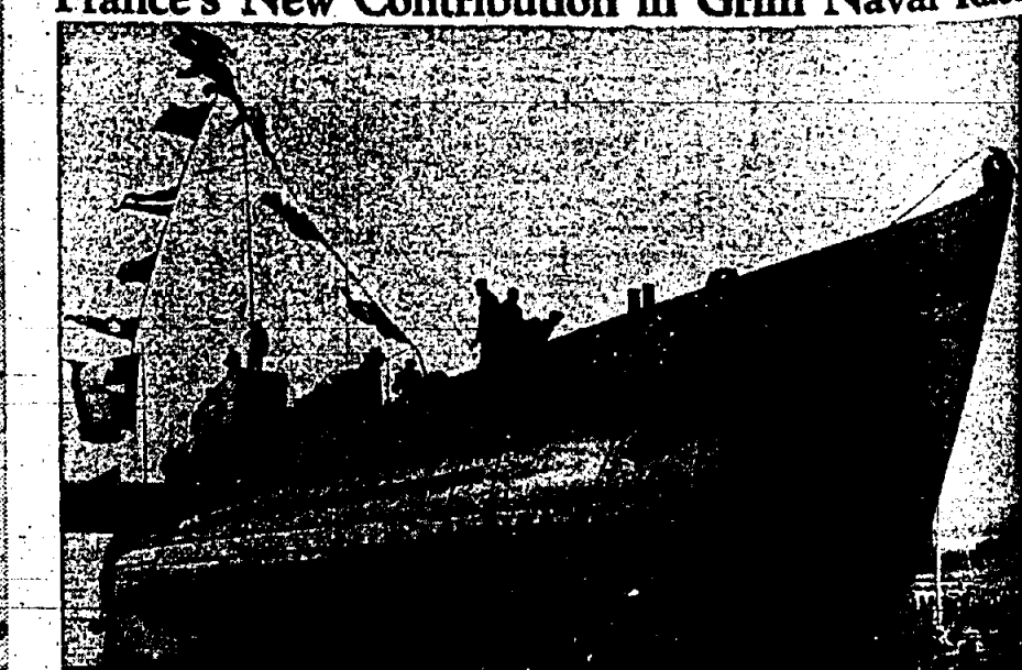
While Germany seeks naval parity with France and to enlarge her navy, the "Venetian" above, built by Italy, designs super-dreadnoughts. France continues to build battleships.