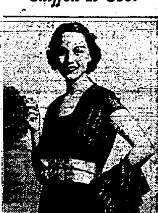
Chiffon is the latest fashion. It is a light, airy fabric that is perfect for warm weather. The woman in the photograph is wearing a beautiful chiffon dress.