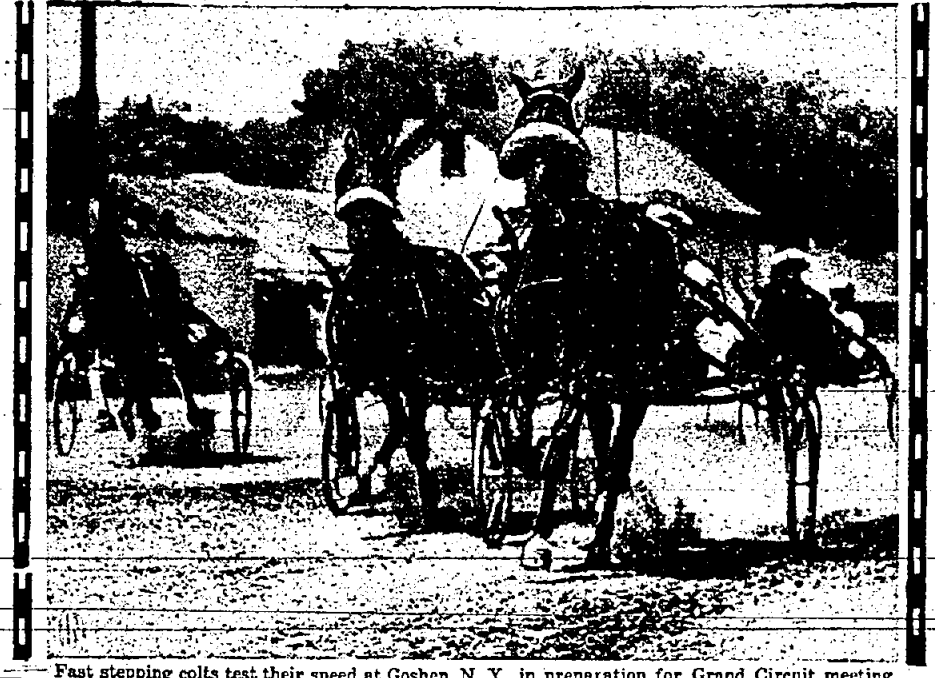
Fast plugging colts test their speed at Goshen, N. Y., in preparation for Grand Circuit meeting.