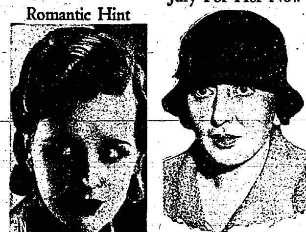
Death on the gallows was the decision of a Los Angeles jury some time ago. The woman in the photograph is a juror who was involved in the trial.