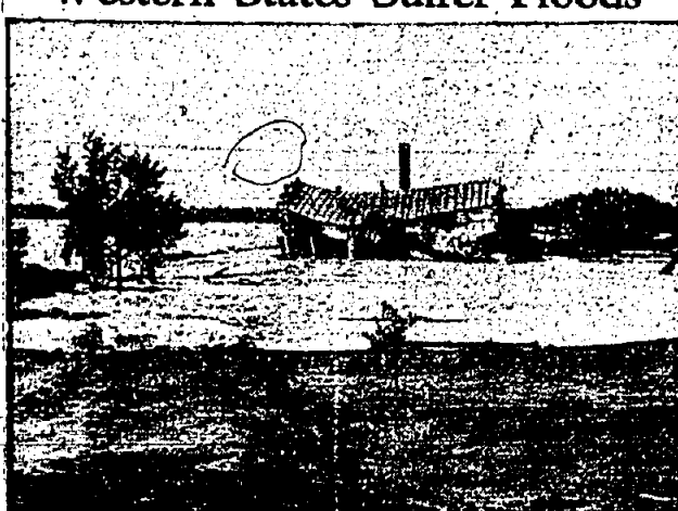
For three days and nights men of McCook, Neb., fought to save the town's electric light plant from destruction but nature was too strong. The water was too high and the winds too strong.