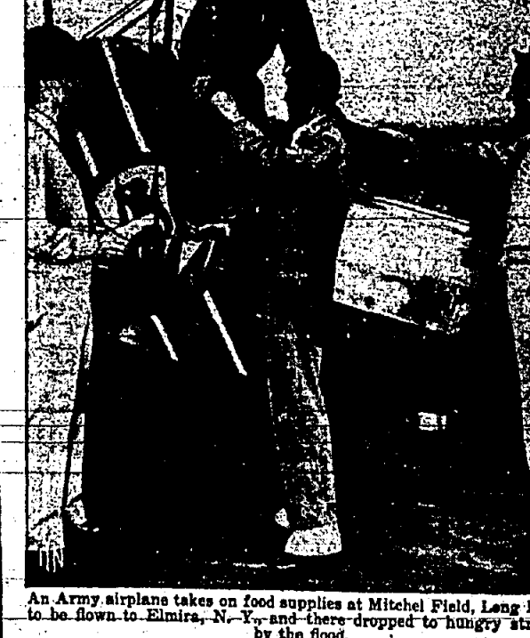
An Army airplane takes on food supplies at Mitchell Field, Long Island, to be flown to Elmiras, N. Y., and dropped to hungry stricken by the flood. The airplane is taking off from the runway, and it is carrying a large load of food supplies.