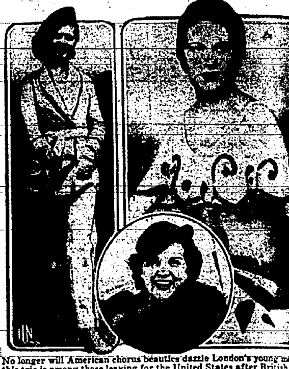
No longer will American chorus beauty leave London's young men this time, as a scene from the play "The Day's News in Pictures" is shown.