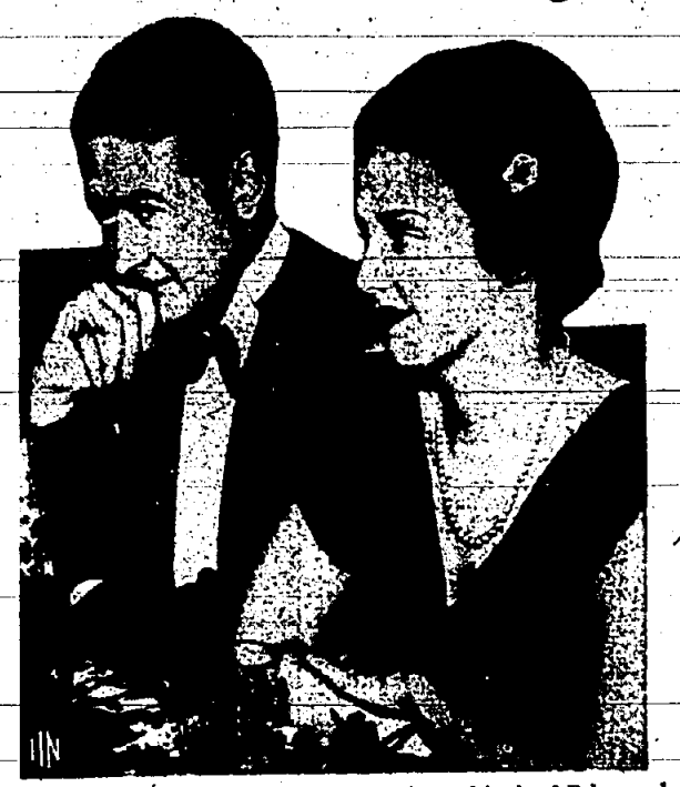
Another international romance nears its end, as friends of Prince and Princess Greville are shown in a scene from the play "The Day's News in Pictures".