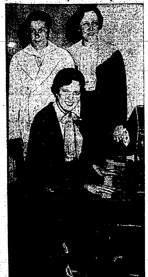
Joe and Maxie feel each other out in a scene from the play "The Day's News in Pictures".