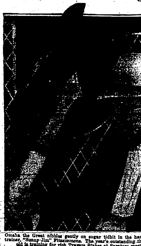
Omaha's Great Nibbles gently on super titbit in the hand of a trainer, "Shammy Jim" Pissinoma, is shown in a scene from the play "The Day's News in Pictures".