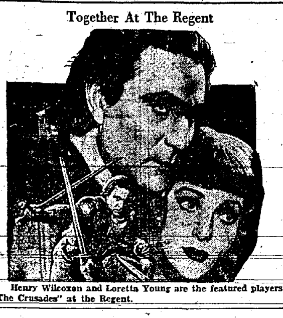
Henry Wilcoxon and Loretta Young are featured again in "The Crusades" at the Regent.