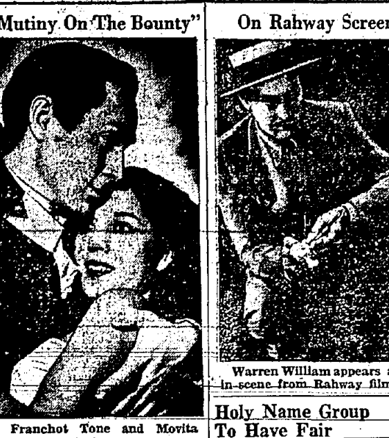
Warren William appears above in scene from Rahway film.