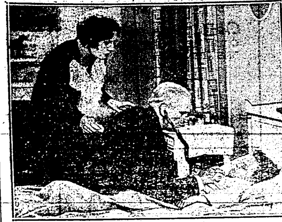
"Public Opinion" is one of the two screen features at the New Empire Theatre Friday and Saturday.

We see good pictures, and we see 'bad pictures' but both kinds good and bad, bear the same stamp of the Hollywood formula. What we crave, and what you probably crave, is something new under the Hollywood sun.