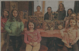
The Junior Garden Club of the Rake and Hoe Garden Club contributes to the Westfield Community with many projects throughout the year. The juniors, who range from kindergarten through high school, meet monthly during the school year to work on projects.