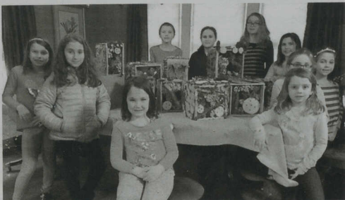
The Junior Garden Club of the Rake and Hoe Garden Club contributes to the Westfield Community with many projects throughout the year. The juniors, who range from kindergarten through high school, meet monthly during the school year to work on projects.